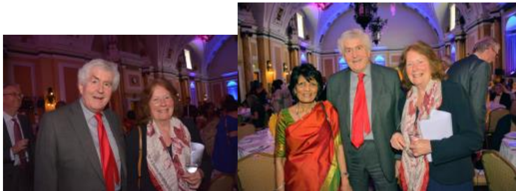
Photo Gallery- EMWWAA Awards 2017